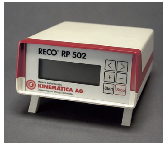
Electronic Programming Unit RECO® RP 502

The optimum working condition is achieved when the drive unit is mounted to the stand PT-ST 7001. This telescopic stand is especially designed to allow easy height adjustments of the motor drive with an integrated gas spring up to 320 mm (other strokes on request).