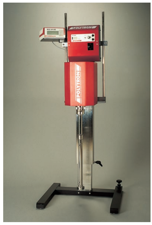
PT 7000 with Stand, RECO<sup>®</sup> RP 502 and Dispersing Aggregate PT-DA 7050/2T

The new POLYTRON® System PT 7000 closes the gap between the underpowered laboratory units and the large-scale industrial processors.