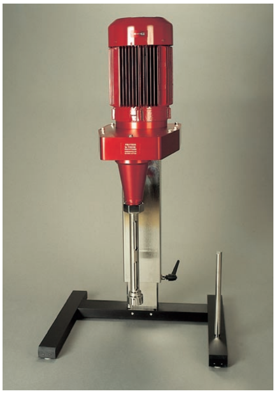
PT-D 36-60 (ex) with Stand ST 9 and Dipersing Aggregate PTA 45/2

Working with heavier 3-phase motors especially in hazardous areas doesn't mean giving up the comfort of a handy stand. Our especially designed telescopic stand ST 9 allows easy height adjustments of the motor drive with an integrated gas spring up to 320 mm (other strokes on request).