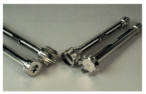
POLYTRON® / BIOTRONA® -Aggregates

Aggregates for the system POLYTRON® PT-D 36-60 (ex) are mounted to the drive in an easy way with the help of an union nut.