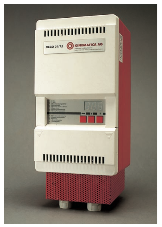
RECO® Frequency Inverter