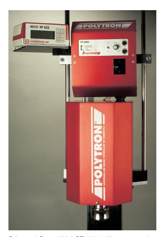
Drive and Control Unit PT 7000 with programming unit RECO ^{\circledR} RP 502

The POLYTRON® PT 7000 Rotor/Stator Homogenizer disperses, emulsifies and reduces the size of solid particles, droplets and gas bubbles to about 1 micron in a more economical, faster and more efficient way than any other comparable devices.